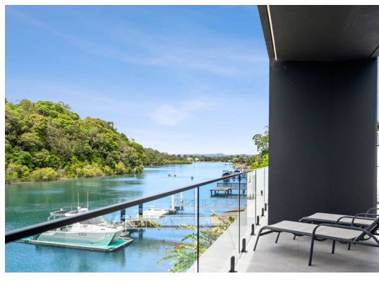
47 Mossman Court | Noosa Heads 5 Bed | 4 Bath | 2 Car Sold 12/12/2022 | $23,250,000