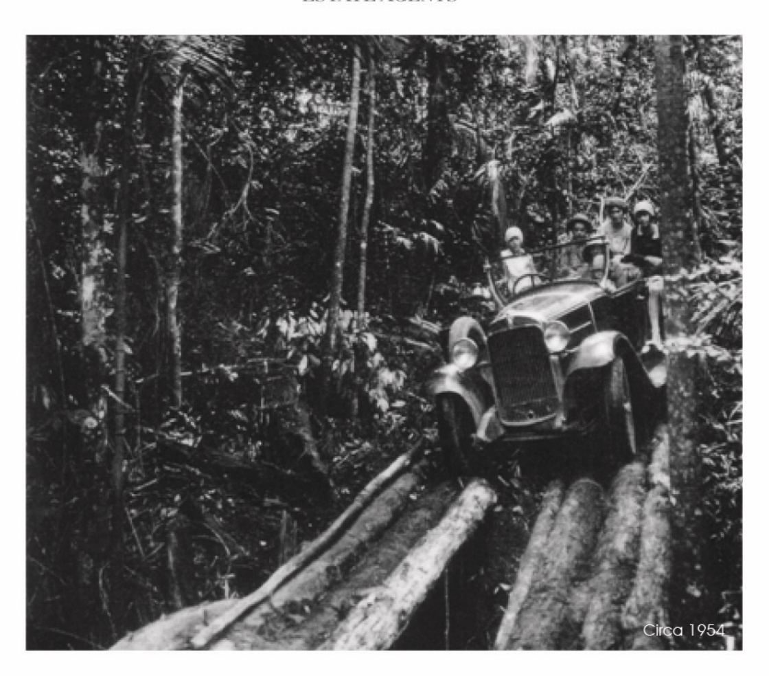
A fresh approach to Noosa's prestige property market.