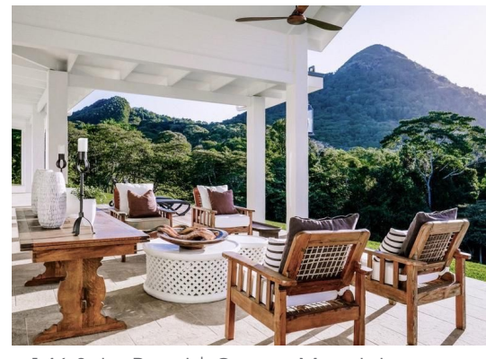
146 Solar Road | Cooroy Mountain 4 Bed | 4 Bath | 8 Car Sold 08/09/2023 | $10,000,000