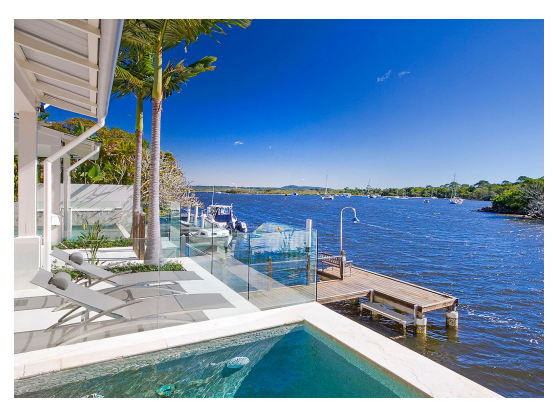
12 Noosa Parade | Noosa Heads 4 Bed | 3 Bath | 3 Car Sold 01/07/2022 | $27,000,000