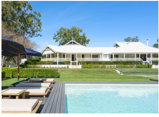
116 Hayward Road | Lake MacDonald 5 Bed | 5 Bath | 5 Car Sold 14/11/2023 | $10,200,000