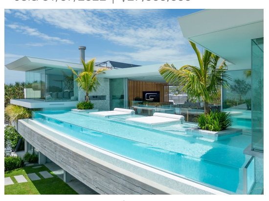
46 Driftwood Drive | Castaways Beach 6 Bed | 6 Bath | 6 Car Sold 01/05/2023 | $13,300,000